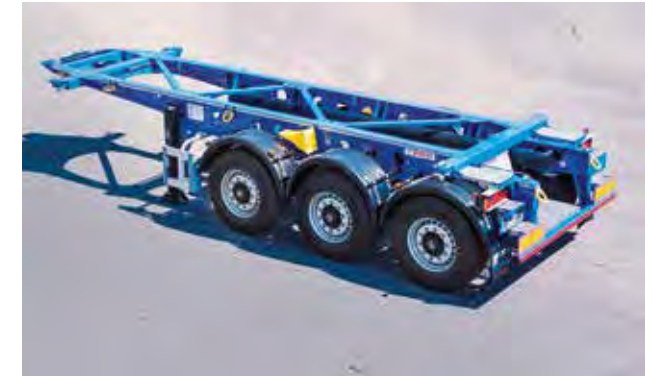
Fixed container chassis type tilting